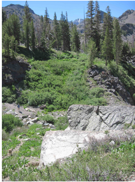
Figure 2: Down Into Deadman Creek.