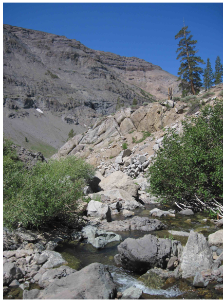
Figure 3: Up the Other Side.