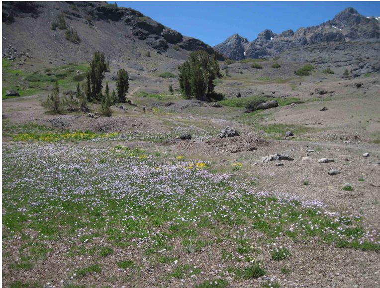
Figure 6: More Wildflowers.