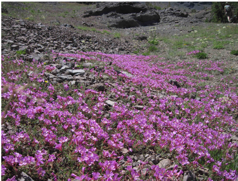
Figure 5: Wildflowers.