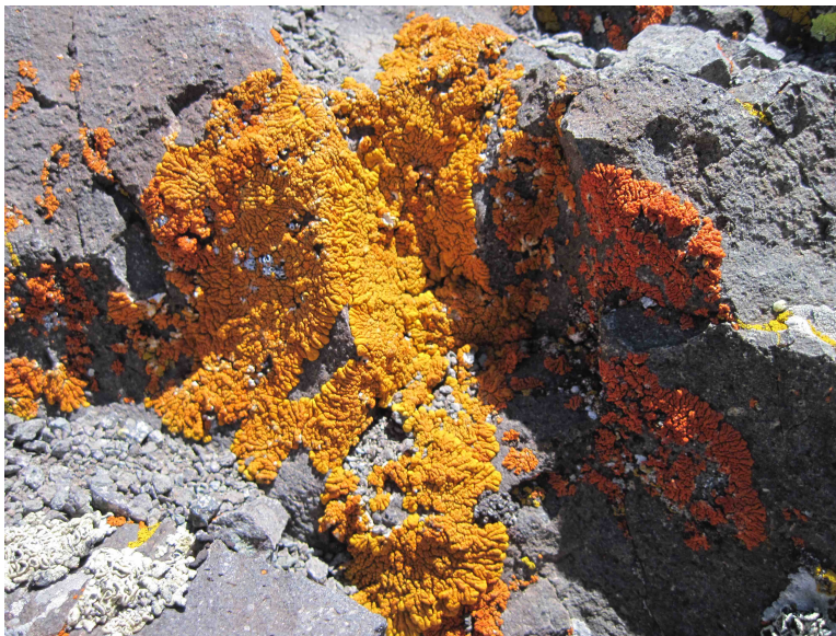
Figure 7: Lichen.