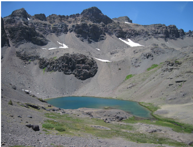
Figure 9: Deadman Lake.