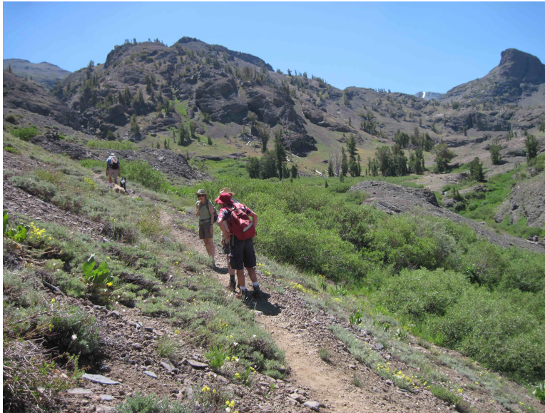
Figure 4: The Trail Up Blue Canyon.