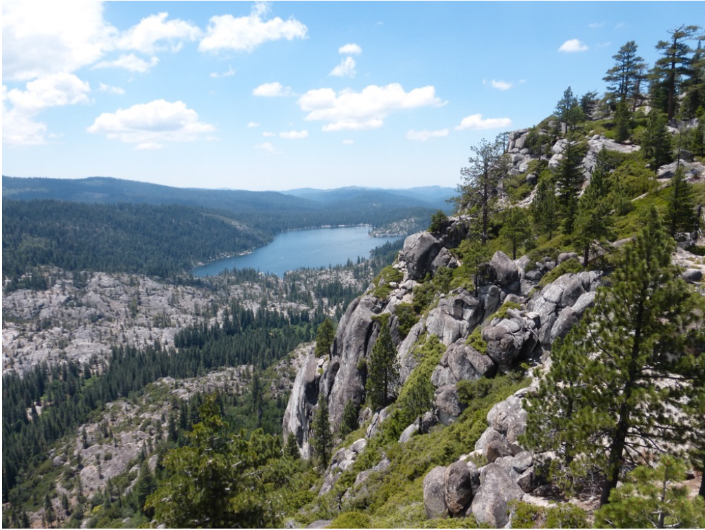
Figure 3: Looking West From East End of Frankenstein's Bluff.

The view of the lake from mark 6 is shown in Figure 3.