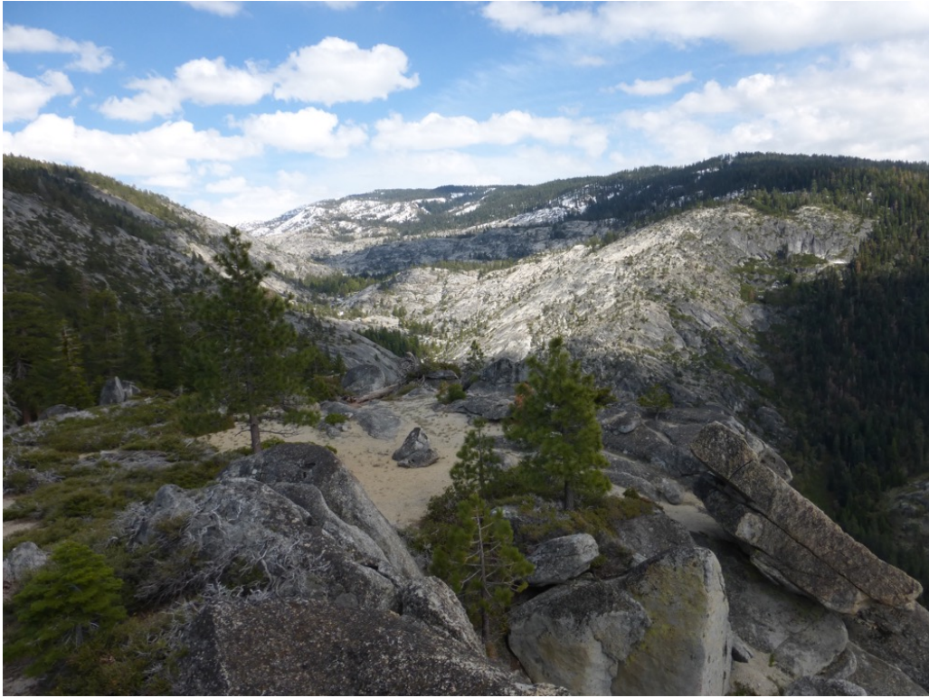
Figure 4: Looking East From West End of Frankenstein's Bluff.

Figure 4 shows the view from mark 5 looking east.