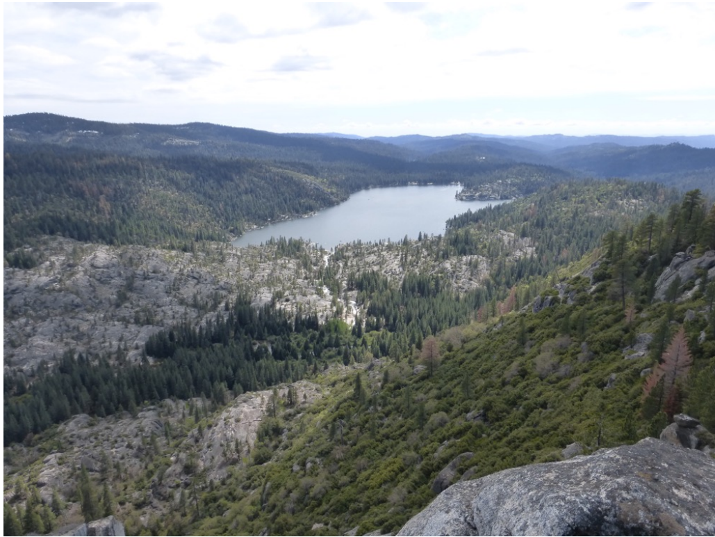
Figure 1: View West From Top of Frankenstein's Bluff.

This is a very short and easy hike that affords one a great view of Pinecrest Lake (see Figure 1). This view is from mark 5 on the map in Figure 2.