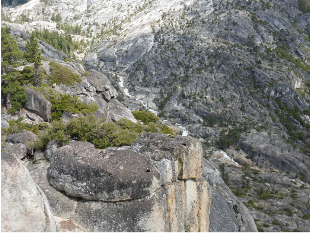
Figure 5: Looking Down at the Stanislaus River.

Figure 5 shows the South Fork of the Stanislaus River from mark 5 on the map. Cleo's Bath can be seen in the picture; it is the green pool just to the right of the granite cliff in the foreground.