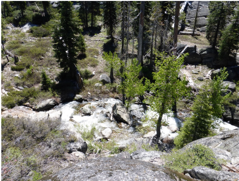
Figure 2: Steep Terrain.

One should walk south through the meadow from this gate until one reaches Bell Creek. One should then turn right and follow the creek. One-half mile after reaching the creek, a very steep section of terrain (mark 2) is encountered; see Figure 2. One can downclimb this section in several ways; it is not necessary to cross the creek.