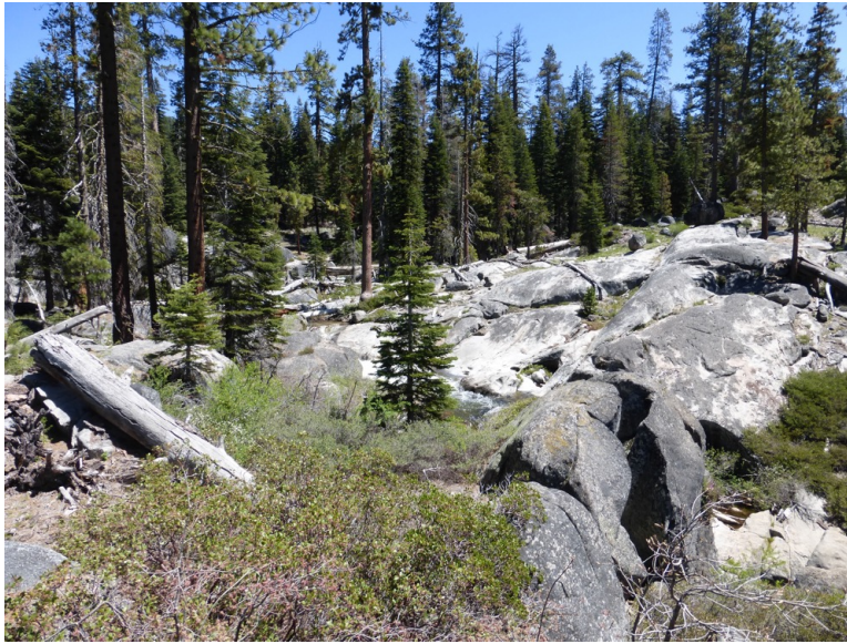
Figure 3: Along Bell Creek.