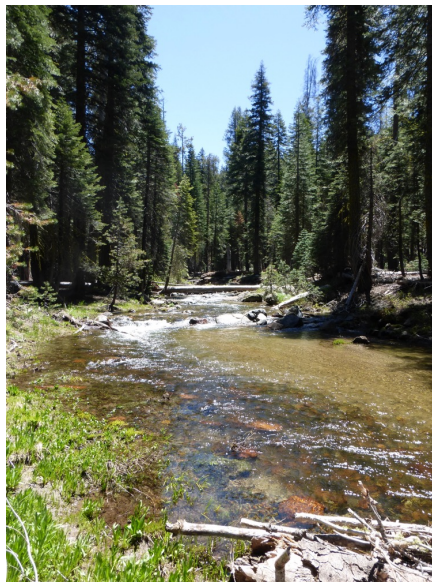
Figure 4: Along Bell Creek.