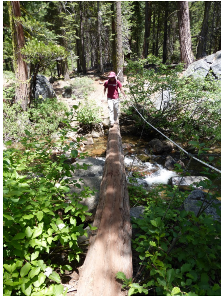
Figure 2: The Log Across Herring Creek.

We note that although a footbridge across the Stanislaus is marked on the map, this footbridge no longer exists. Nevertheless, just below mark 4 on the river, one can safely cross on a very large fallen tree. We will return to this possibility below. If one does not cross the river, then one should continue on the trail down the north side of the river. Within a few hundred yards of mark 4, the trail leaves the river and goes into the forest for a short distance, until it reaches Herring Creek. Figure 2 shows the log across this river at mark 5; the crossing is easy.