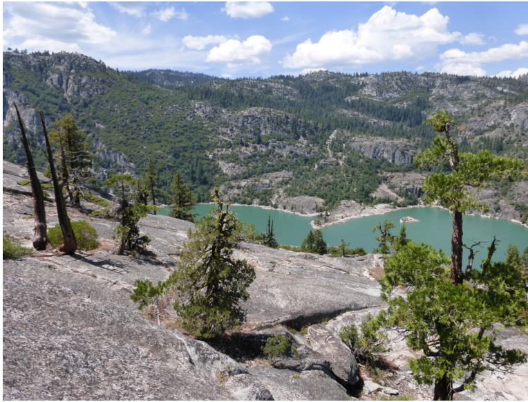
Figure 5: On the Ramp.