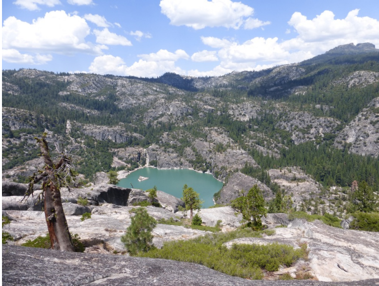
Figure 4: At the Top of the Ramp.

Once the top of the ramp has been reached, then one simply continues down the ramp as far as desired. Some of the views from the ramp are shown in Figures 4, 5, and 6. In the spring and summer, it is not possible to safely cross the river at the bottom of the ramp. One simply retraces one's steps to get back to 108.