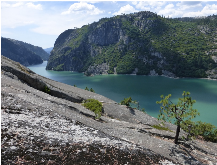
Figure 6: On the Ramp.