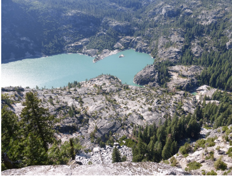
Figure 2: The Ramp From Donnell Vista.