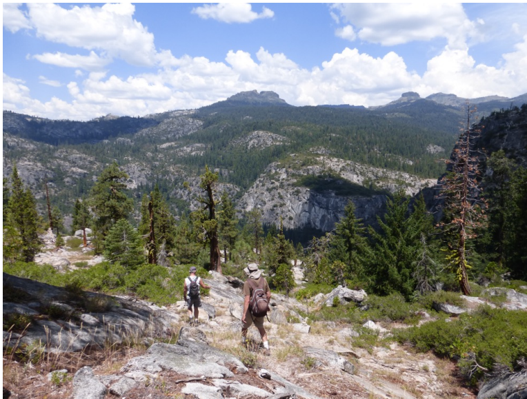
Figure 3: Above the Ramp.