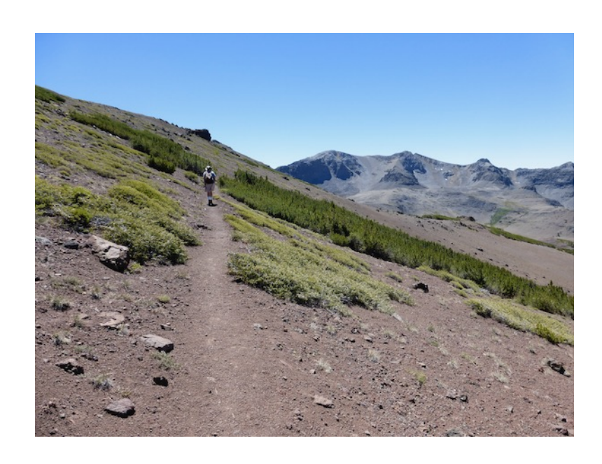
Figure 2: On the Ridge Approaching Leavitt Peak.